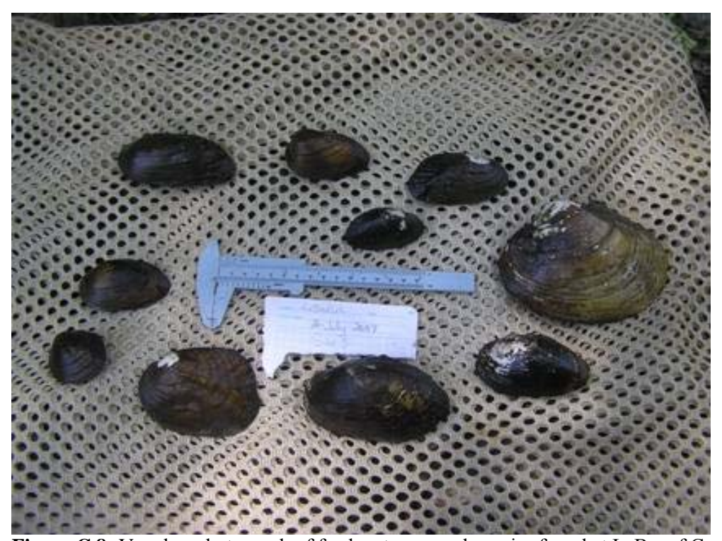
Figure C.8: Voucher photograph of freshwater mussel species found at LeBoeuf Creek Site 4. Label in photograph incorrectly labeled as site 3.