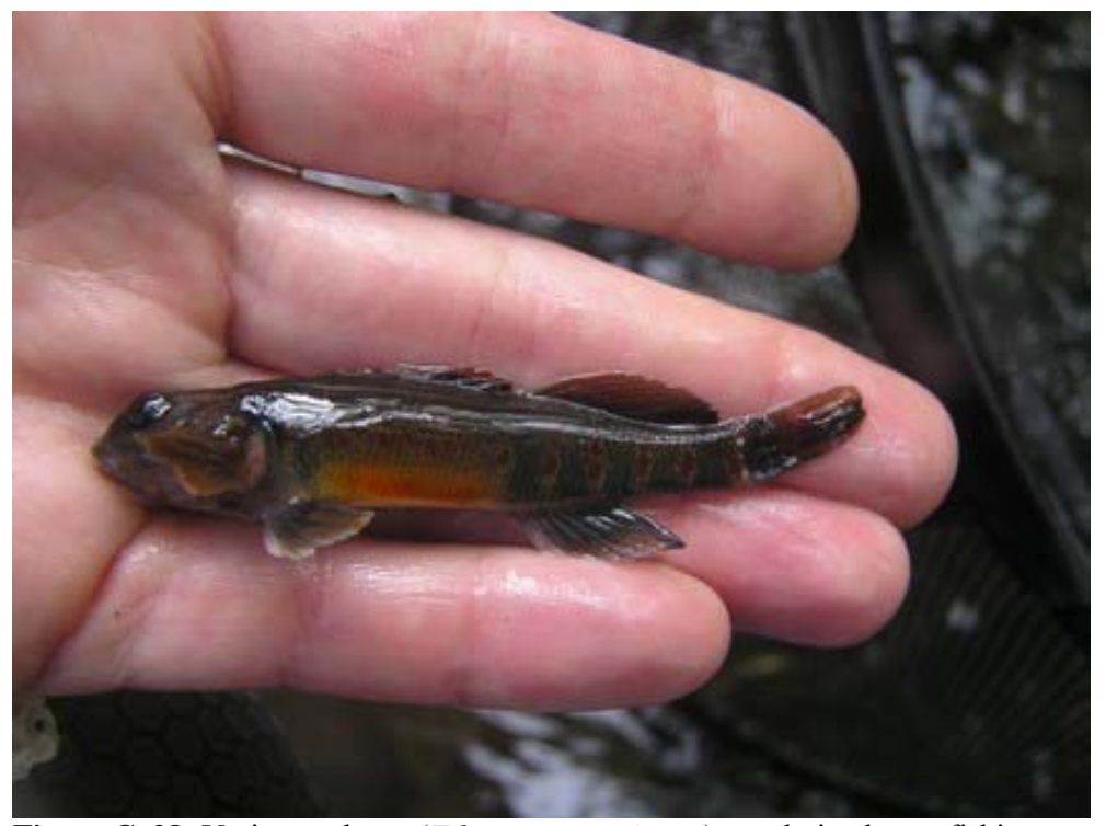
Figure C. 28: Variegate darter ( Etheostoma variatum ) caught in electro-fishing survey.