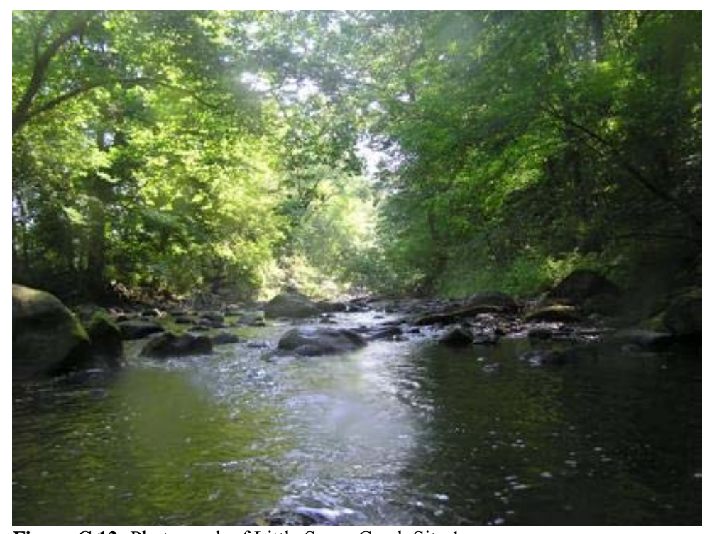
Figure C.12: Photograph of Little Sugar Creek Site 1.