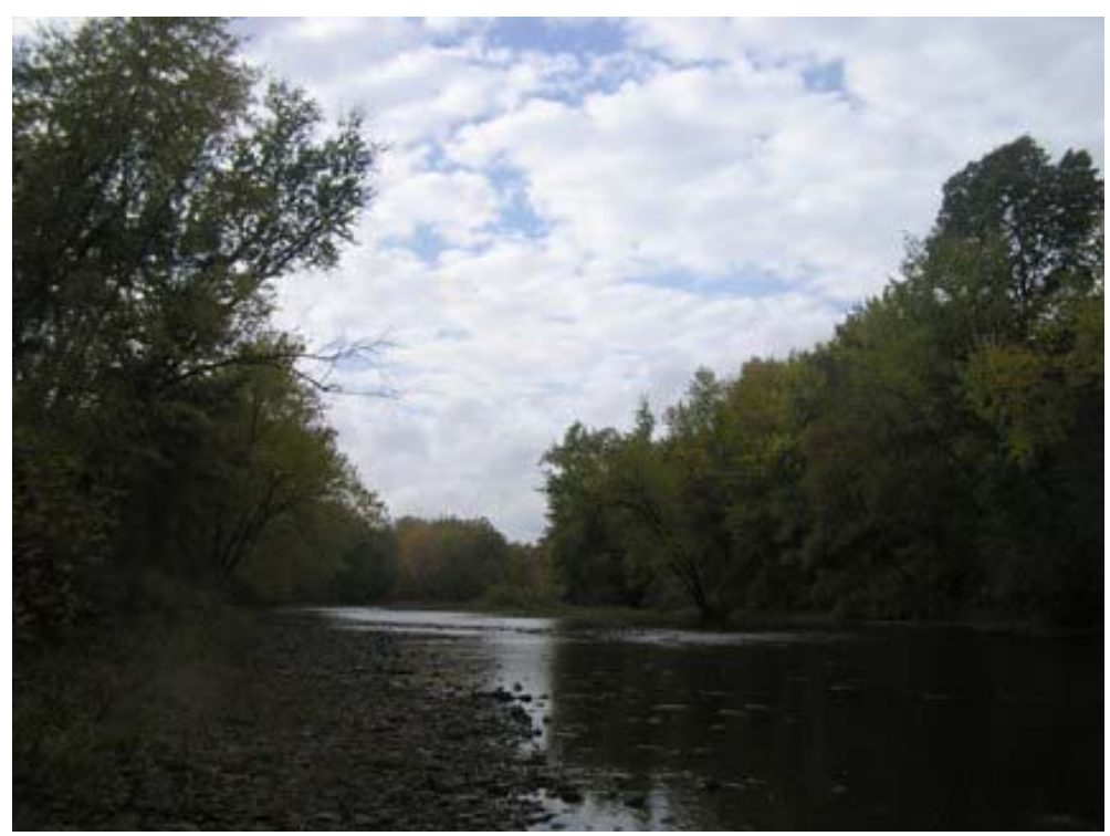
Figure C.15: Photograph of Sugar Creek Site 3.