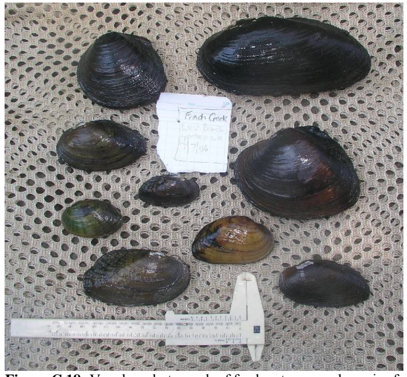
Figure C.18: Voucher photograph of freshwater mussel species found at West Branch Site 3.