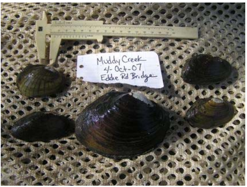
Figure C.13: Voucher photograph of freshwater mussel species found at Muddy Creek Site 1.