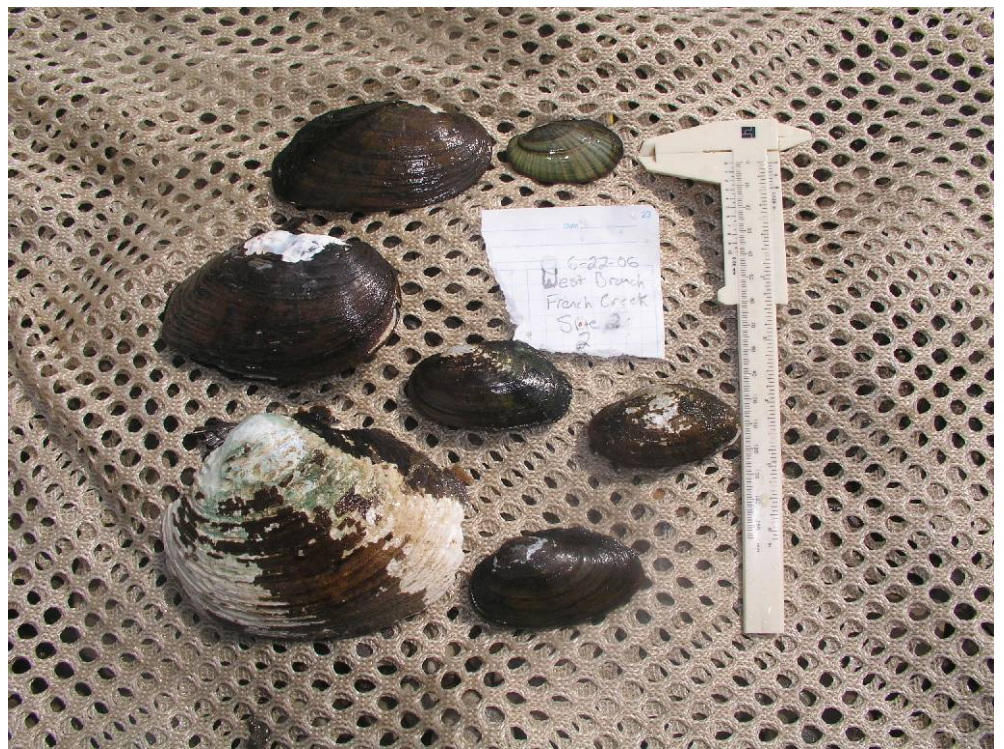
Figure C.17: Voucher photograph of freshwater mussel species found at West Branch Site 2.