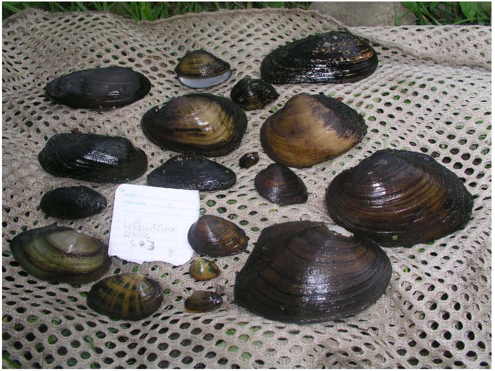
Figure C.7: Voucher photograph of freshwater mussel species found at LeBoeuf Creek Site 3.