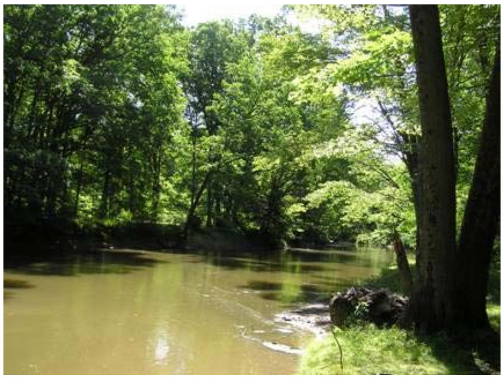
Figure C.3: Photograph of Cussewago Creek Site 1.