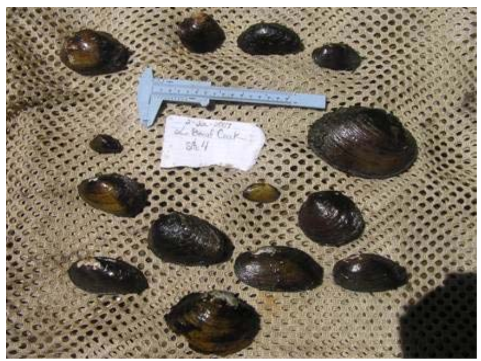
Figure C.11: Voucher photograph of freshwater mussel species found at LeBoeuf Creek Site 5. Label in photograph incorrectly labeled as site 4.