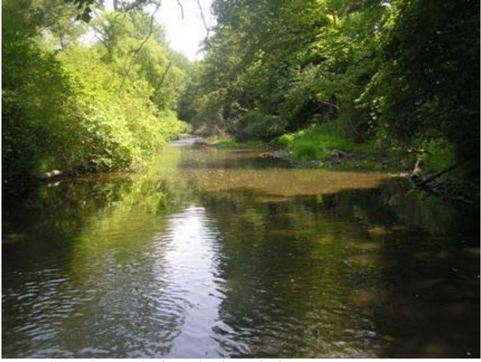
Figure C.22: Photograph of Woodcock Creek Site 2.