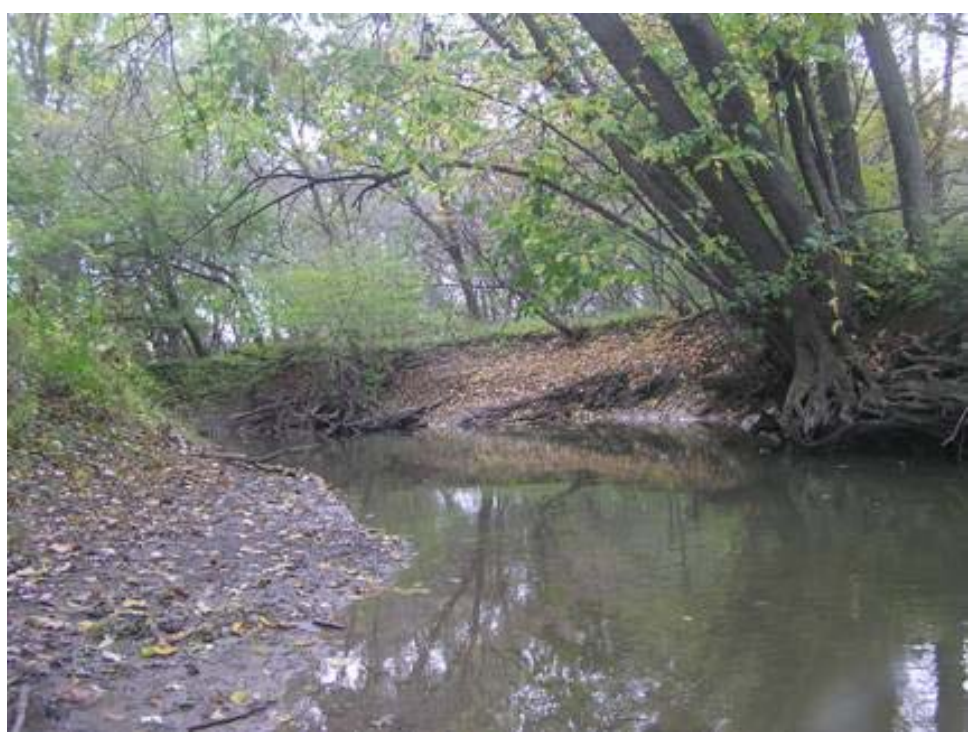
Figure C.19: Photograph of West Branch French Creek Site 3.