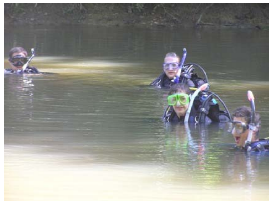
Figure C.4: Photograph of mussel surveyors at Cussewago Creek Site 1.