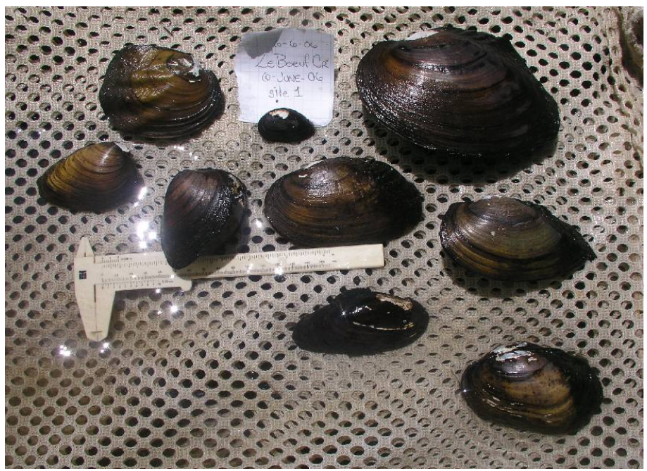
Figure C.5: Voucher photograph of freshwater mussel species found at LeBoeuf Creek Site 1.