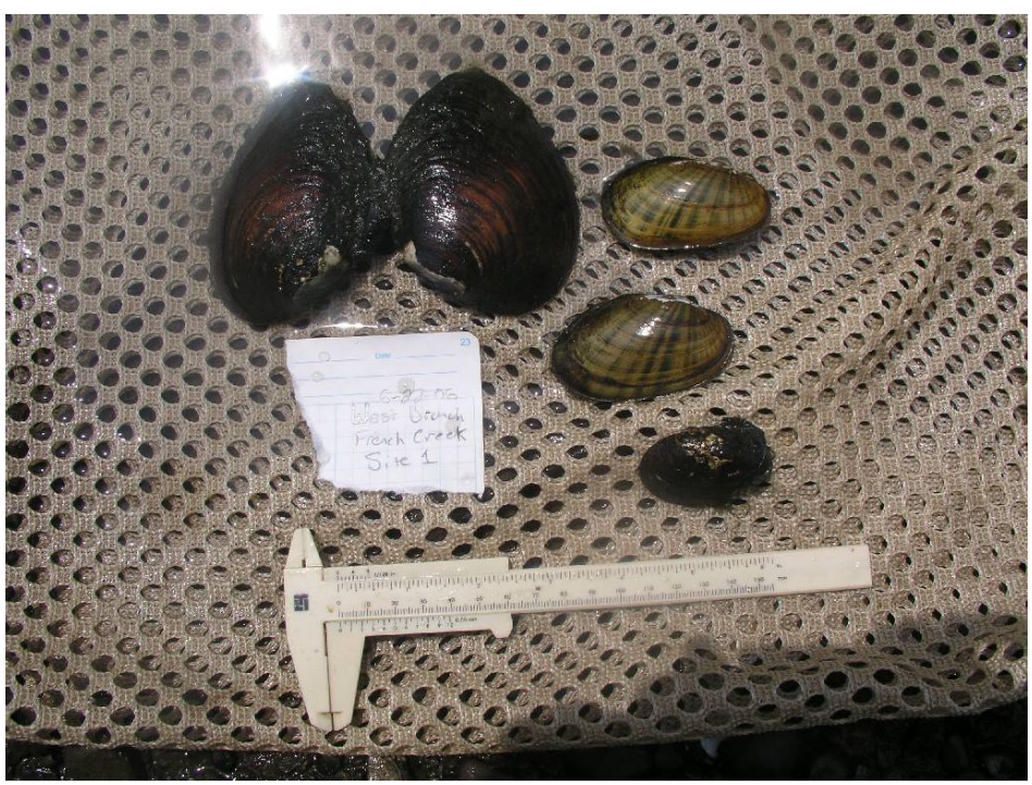
Figure C.16: Voucher photograph of freshwater mussel species found at West Branch French Creek Site