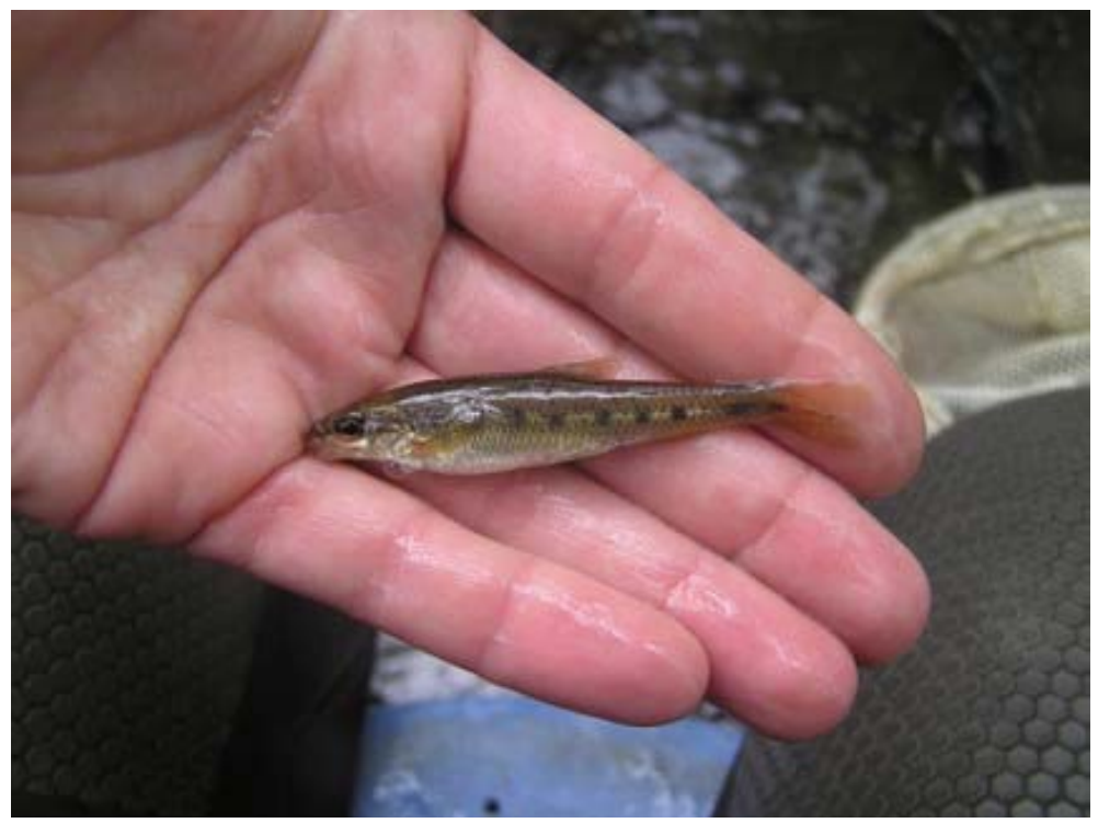
Figure C. 27: Streamline chub ( Erimystax dissimilis ) caught in electro-fishing survey.