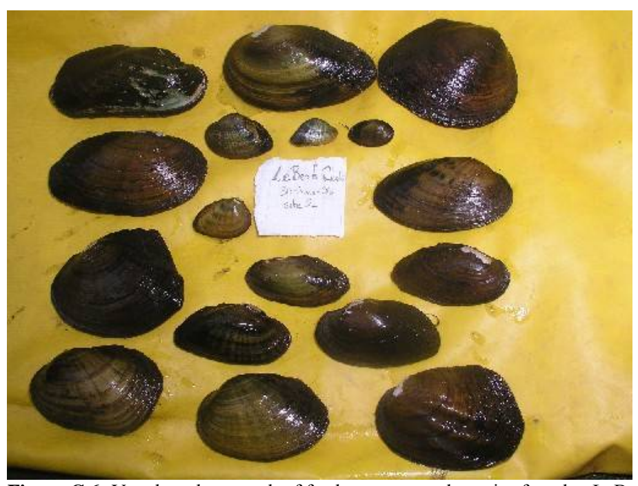
Figure C.6: Voucher photograph of freshwater mussel species found at LeBoeuf Creek Site 2.