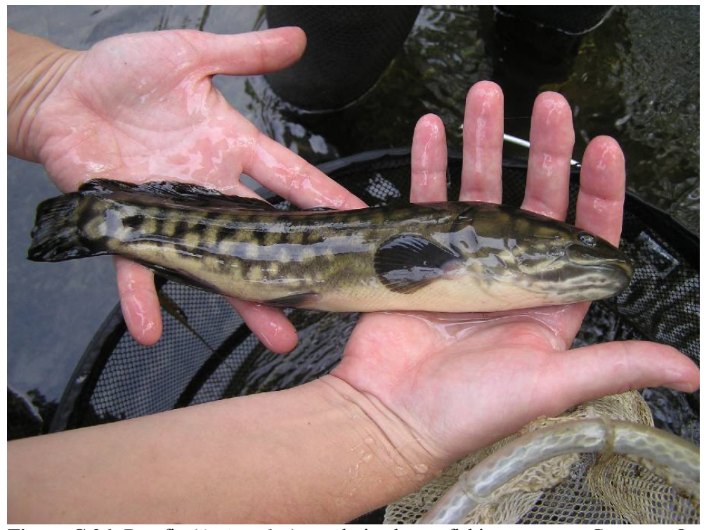
Figure C.26: Bowfin (Amia calva) caught in electro-fishing survey at Conneaut Outlet site.