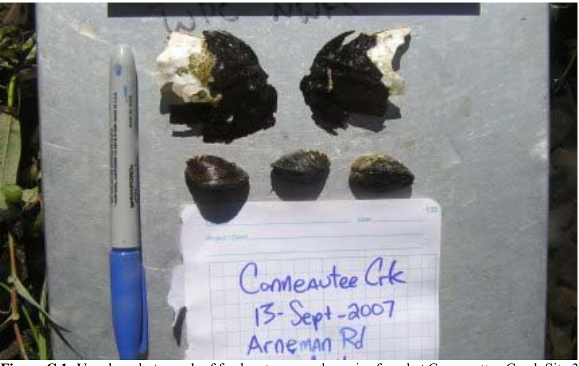
Figure C.1: Voucher photograph of freshwater mussel species found at Conneauttee Creek Site 3.