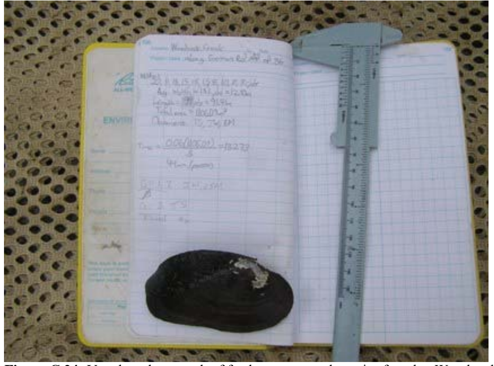
Figure C.24: Voucher photograph of freshwater mussel species found at Woodcock Creek Site 3.