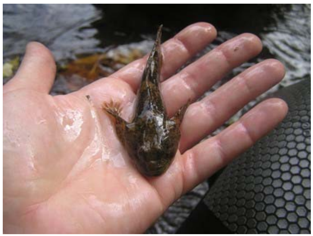
Figure C. 29: Mottled sculpin (Cottus bairdi) caught in electro-fishing survey.