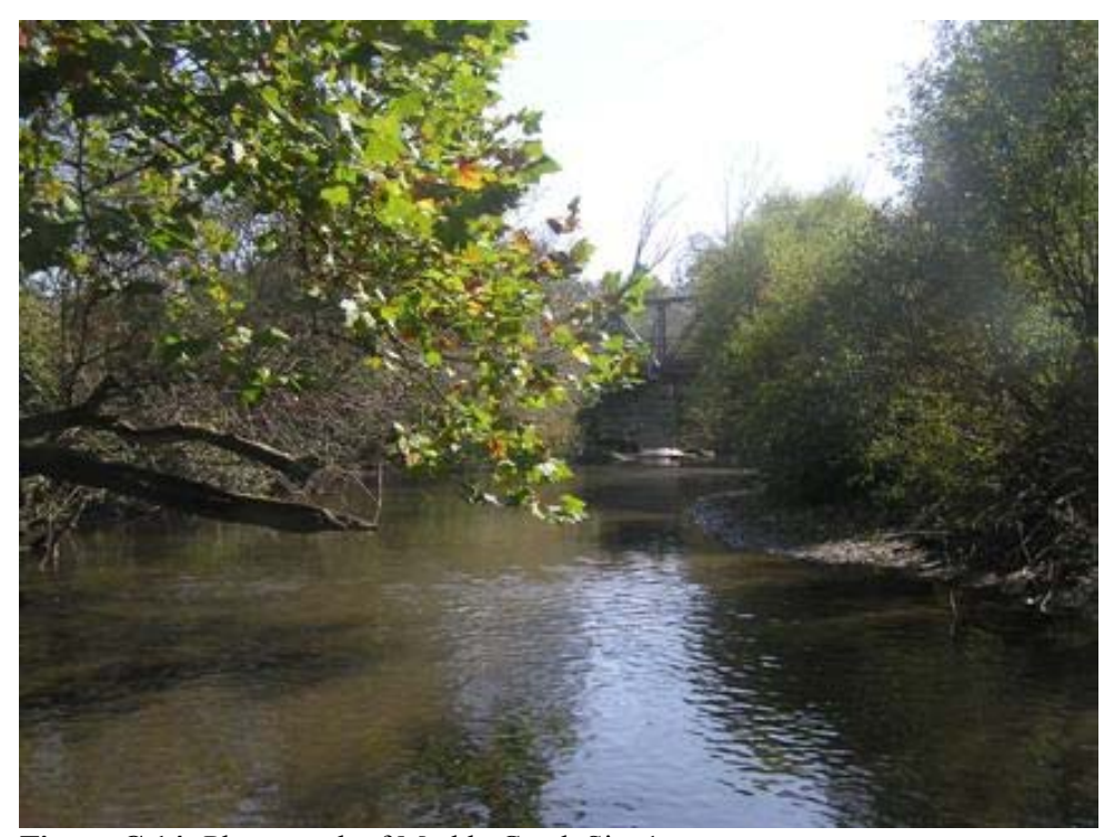
Figure C.14: Photograph of Muddy Creek Site 1.