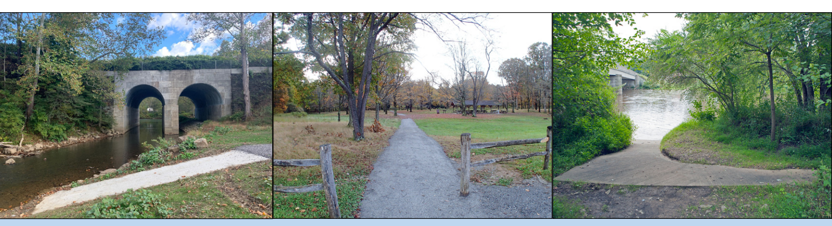
This access site in Bolivar, Pa., features a gentle, paved slope to the water.