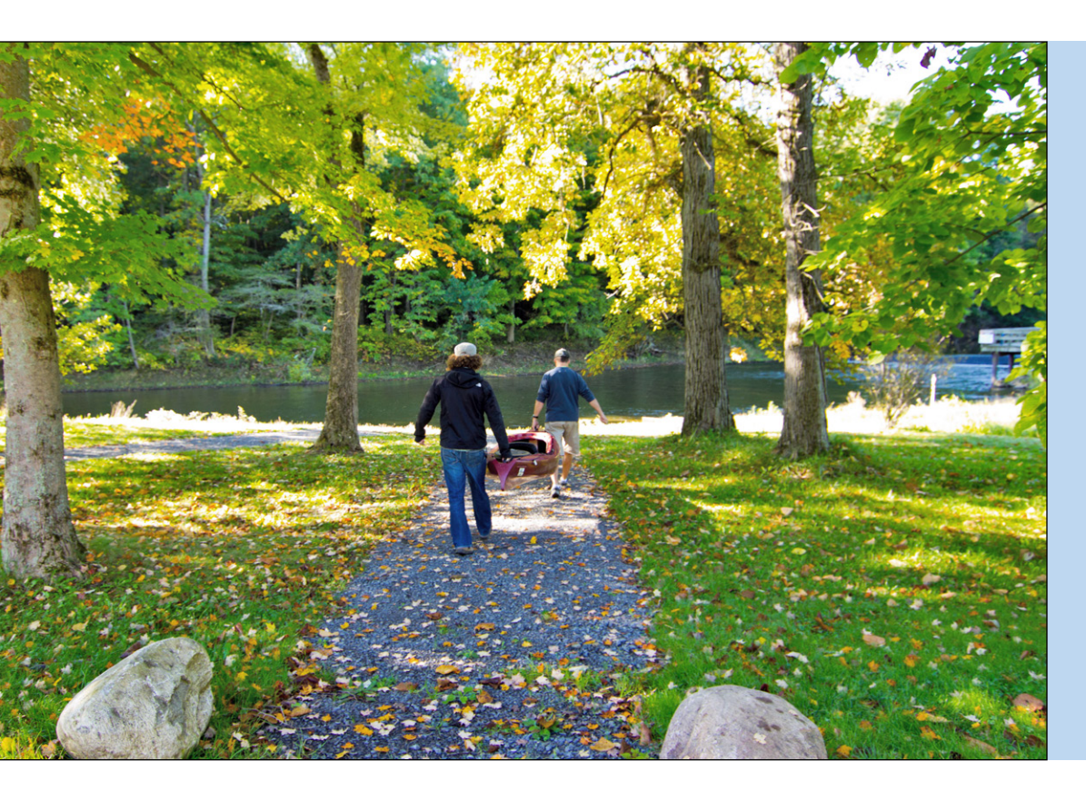
This site on Pymatuning Creek is welcoming and beautiful in all seasons.