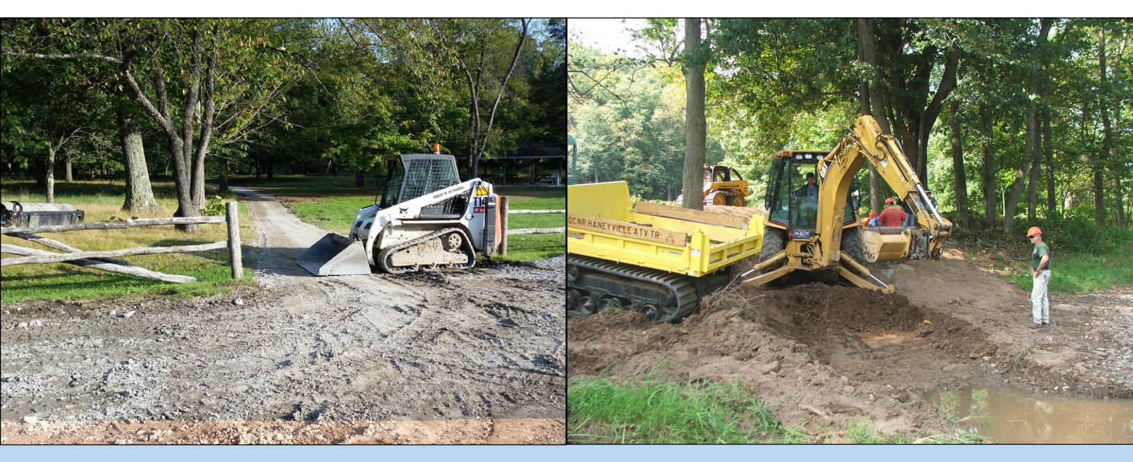
Canoe ramps can be built quickly with machines and small equipment.