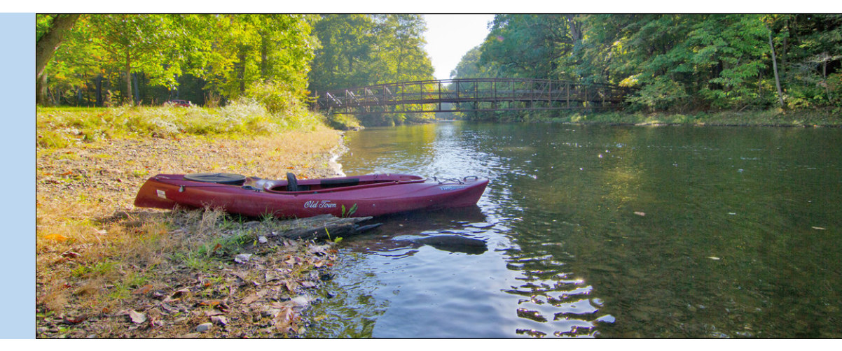
A canoe access on Pymatuning Creek in Jamestown, Pa., is located within Pymatuning State Park.