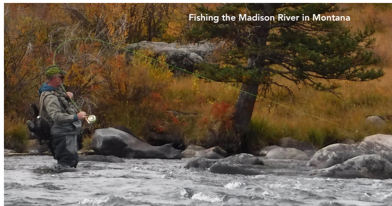
Fishing the Madison River in Montana

interested in sports, the nearby woods were his playground where he camped and built forts with his friends. He described himself as being "sensitized to nature," and embraced this as he grew up. He received a scholarship to the University of Pennsylvania in Philadelphia and was an honors graduate with a degree in biochemistry and molecular biology. He attended graduate school at the University of Montana and then taught there for a couple of years.