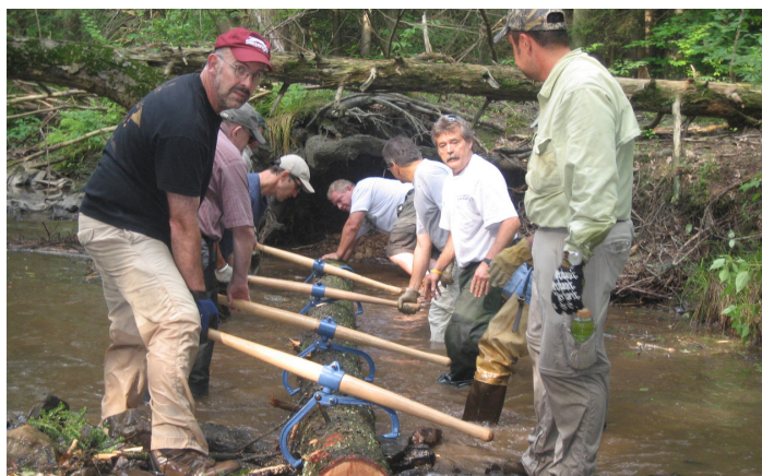
Volunteering with a Trout Unlimited and PA Fish Commission stream improvement project on Manada Creek in Dauphin County, Pa.

Although he had planned to eventually move back west, career opportunities with a multinational company in Harrisburg kept him in Pennsylvania for more than 30 years. He worked in