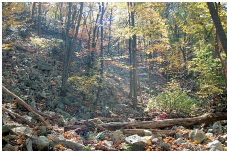
Hardwood Trails, a 1,600 acre property on Evitts Mountain, Bedford County that WPC protected in December 2011.

For five consecutive years, the Western Pennsylvania Conservancy has received a four-star rating out of a possible four stars from Charity Navigator, America's largest independent evaluator of charities. Rated exceptional for financial health, accountability and transparency, this recent ranking places the Western Pennsylvania Conservancy in the top 4% of all charities that Charity Navigator ranks.