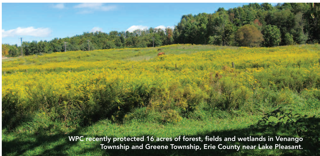
WPC recently protected 16 acres of forest, fields and wetlands in Venango Township and Greene Township, Erie County near Lake Pleasant.

Eight people made a significant and lasting impact on the Western Pennsylvania Conservancy in 2011 — collectively contributing through their bequests more than $900,000 towards our work. Whether the gift was a few thousand dollars or a few hundred thousand dollars, these donors cared enough about our work to make us a part of their “families” through bequests. We gratefully acknowledge their generosity and foresight. They have passed away, but their commitment to conserving Western Pennsylvania’s land, water, and life continues. We are pleased to honor their legacies through the following brief biographies: