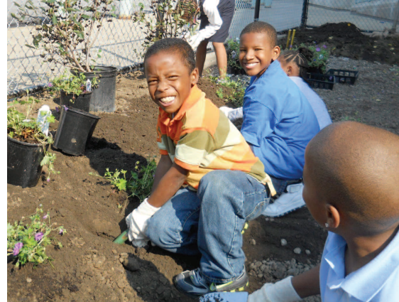
Students planting at Weil Elementary

..... Our 135 community gardens across 20 counties encouraged volunteers — from school-age to senior citizens — to dig in the earth and create something beautiful. The gardens gave a dose of nature and displayed beautiful flowering colors for hundreds of thousands of commuters each day.