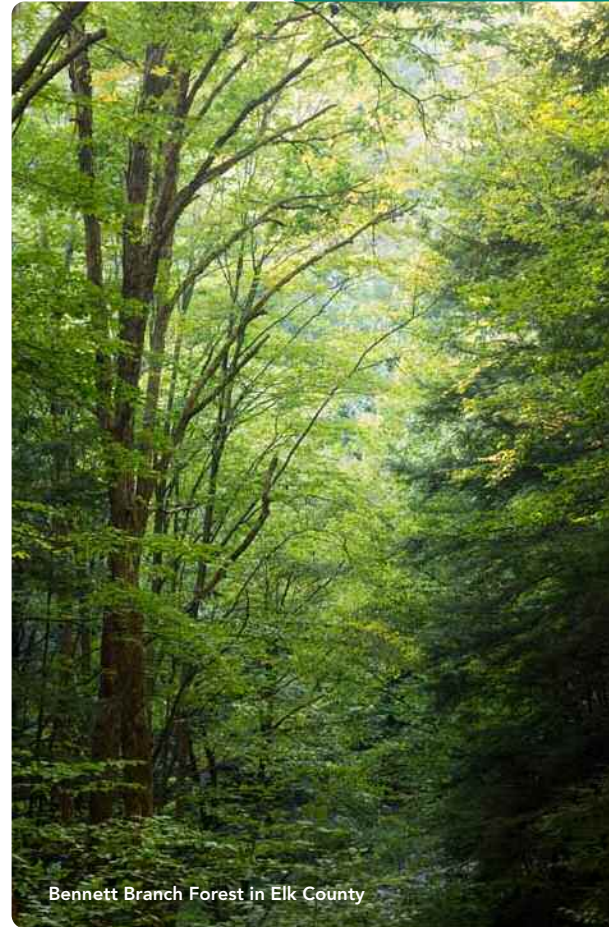
Bennett Branch Forest in Elk County

* As of March 2013. Assumes IRS discount rate of 1.4% and a cash gift. Subject to change.