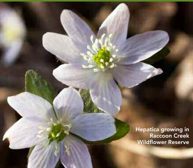
Hepatica growing in Raccoon Creek Wildflower Reserve

To register, call 412-586-2340 or log onto www.WaterLandLife.org .